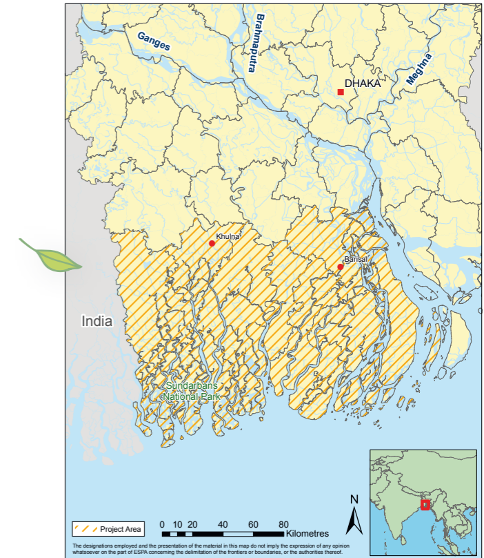
Bangladesh Case Study Area